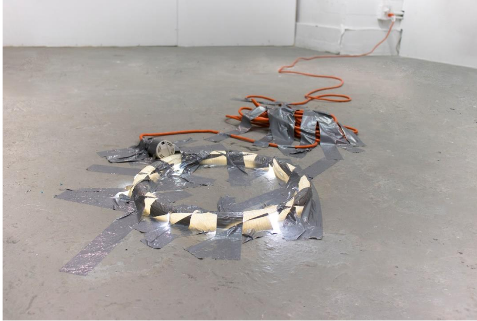
Bat-Ami Rivlin, Untitled (DUCT TAPE, LED, CORD, BALLAST) , 2019. Duct tape, LED circular light bulb, extension cord, ballast.